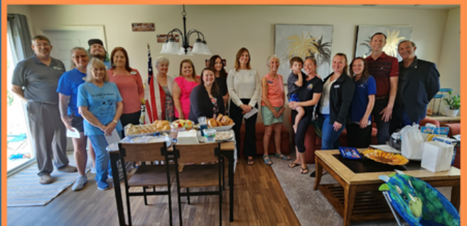
Claire's Home Dedication Celebration