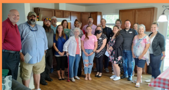
Mary's Home Dedication Celebration