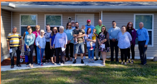
Priddy Home Dedication Celebration