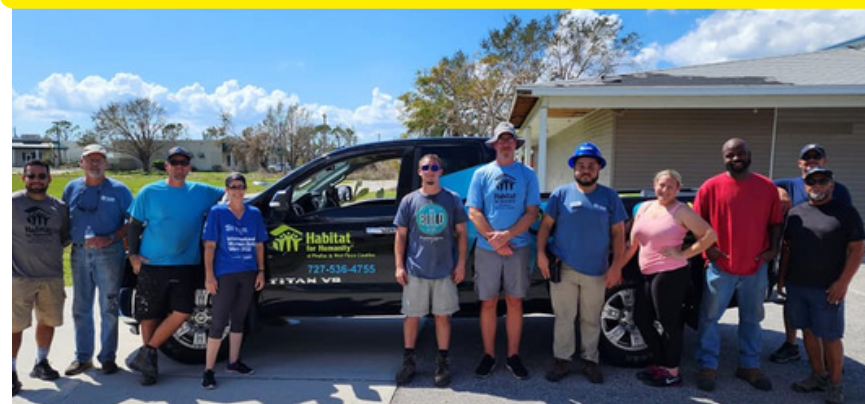
Habitat for Humanity of Pinellas and West Pasco Counties

We appreciate the support from our fellow Habitat Affiliates who cared for us in the days and weeks following Hurricane Ian.