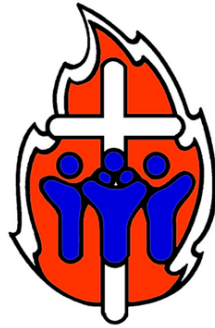
Burnt Store Presbyterian Church